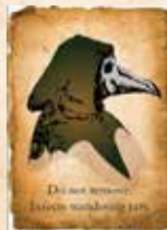
Rat and Plague cards