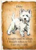
Dog cards from Rats in the Walls