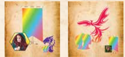
Wild Vassal cards