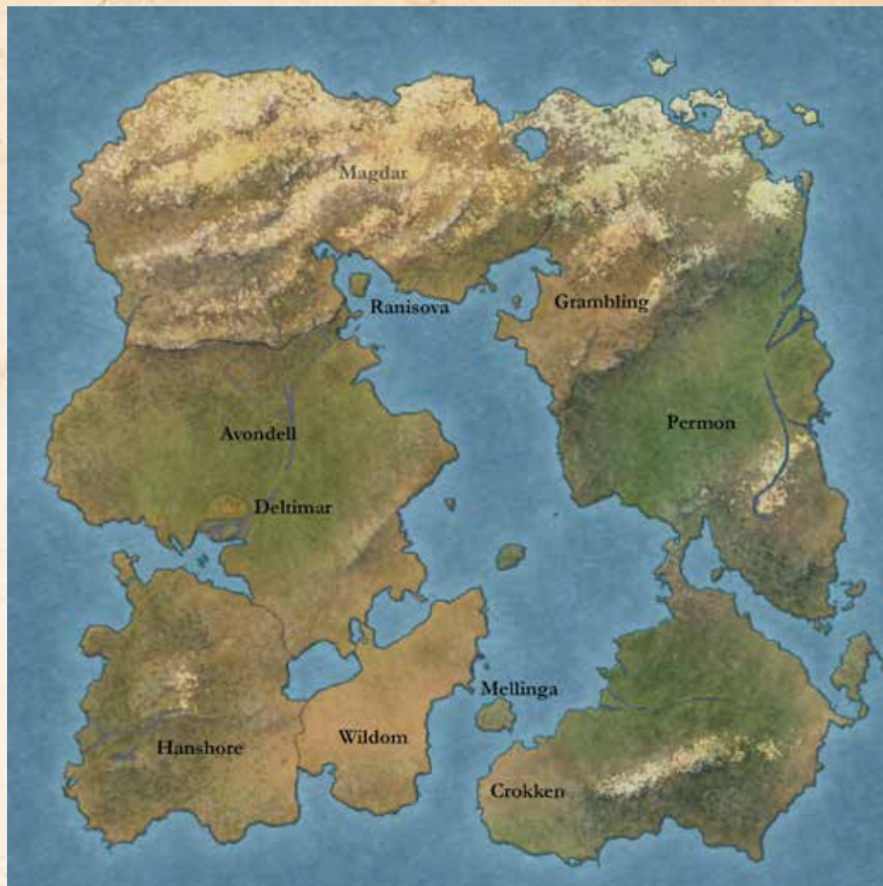
Westarland. Blackstone Castle is in Avondell, in the capital city of Deltimar.

You can help. Use your influence with knights and wizards, and the king himself, to carry out missions for the king.