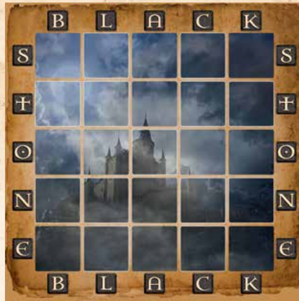
Blackstone Castle game board