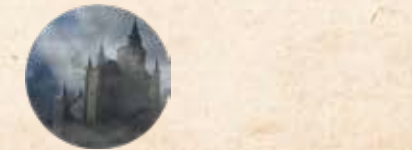
Castle (completion) token