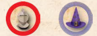
Knight and Wizard tokens